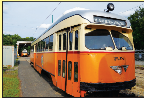
MBTA Red Line PCC cars in full service operation today.