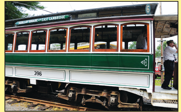
East Cambridge home of HubSpot the newest IPO