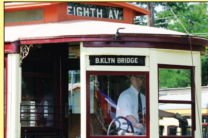
Bklyn Bridge today the home of innovation center and a key stop on NYC mass transit's innovation lines throughout Brooklyn (this trolley resides at the Seashore Trolley museum

Quietly just down the rail from Brunswick to Biddeford, Saco and Kennebunk, the Seashore trolley museum celebrated its 75th anniversary this year. This Saco & Biddeford trolley car was the first acquisition that catalyzed the community into action. Today, Biddeford is the home of Engine, a startup and revitalization community building near today's modern rail line. http://feedtheengine.org/